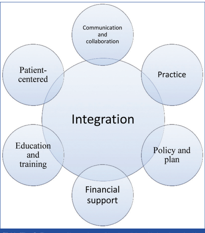
[Table/Fig-4]: Elements of integrating traditional medicine with the primary health care

[Table/Fig-5] displays themes and related codes identified in the reviewed studies.